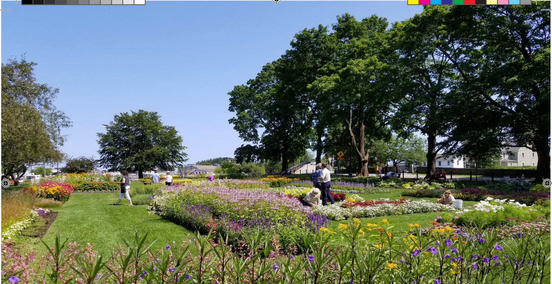
Image: Prescott Park